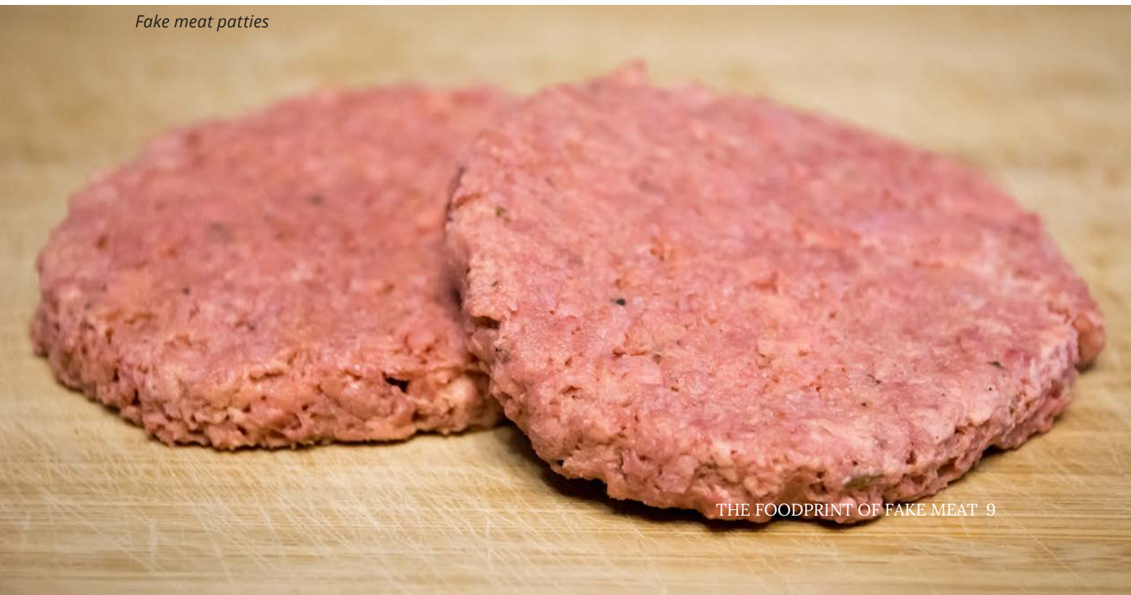
Fake meat patties

Meat alternatives are formulated from a mix of ingredients, including protein isolates, fats, flavorings and other additives. Like older generation plant-based proteins, the proteins that make up ultra-processed meat alternatives come from crops; but unlike the ones used in tofu and other