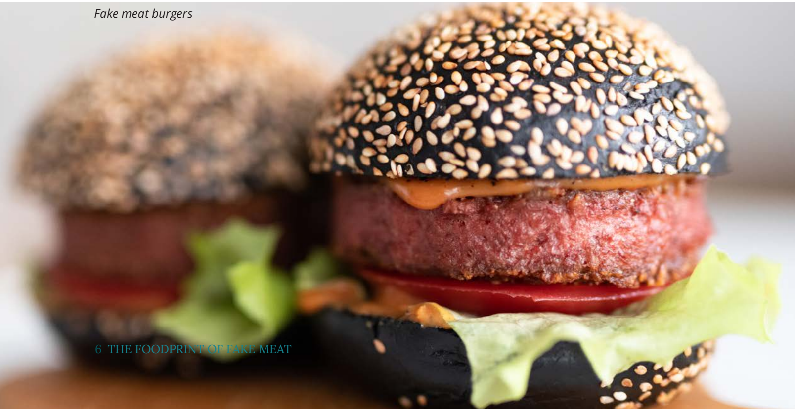
Fake meat burgers