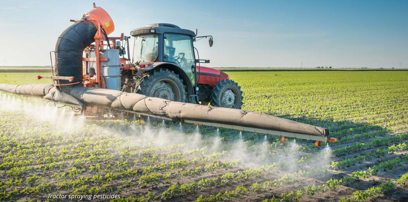
Tractor spraying pesticides

Products that are made with soy often come from soybeans that have been genetically modified to resist the herbicide glyphosate or other weedkillers. This allows farmers to spray entire fields in herbicides, killing weeds and leaving the plants intact. This damages soils, harms insects, and accelerates the evolution of “superweeds” that resist multiple herbicides, pushing farmers to use more and more toxic chemicals in addition to glyphosate. 47 48 49