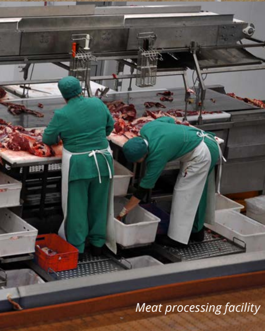
Meat processing facility