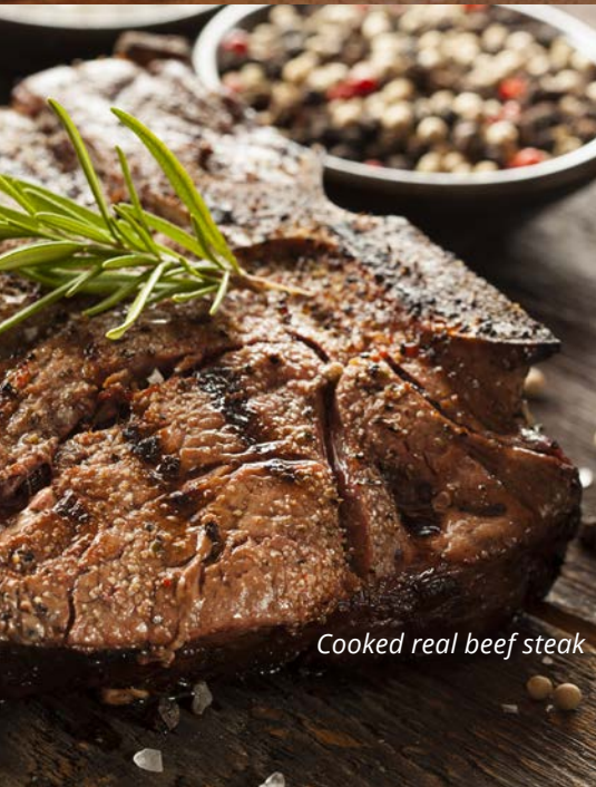
Cooked real beef steak