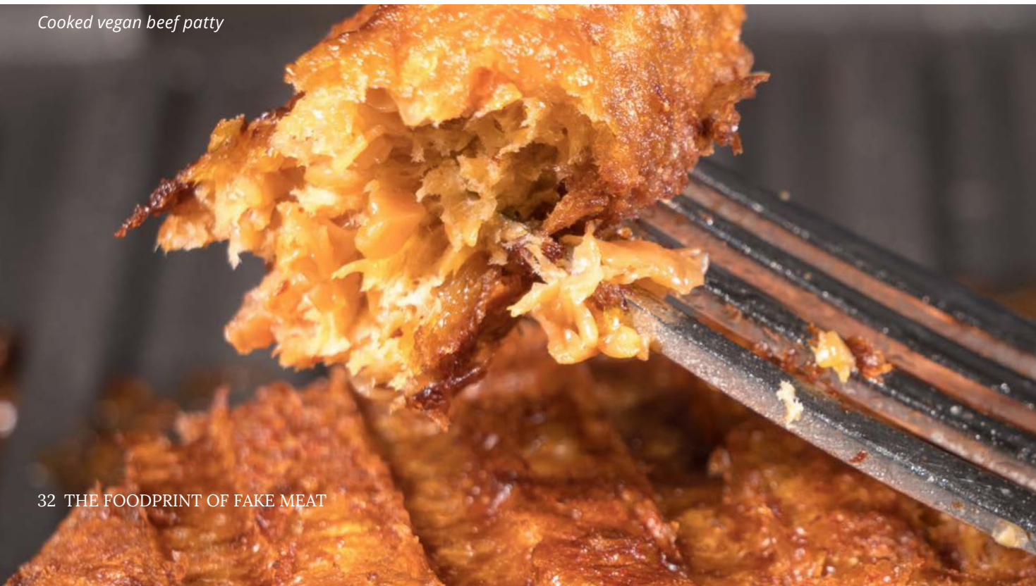
Cooked vegan beef patty