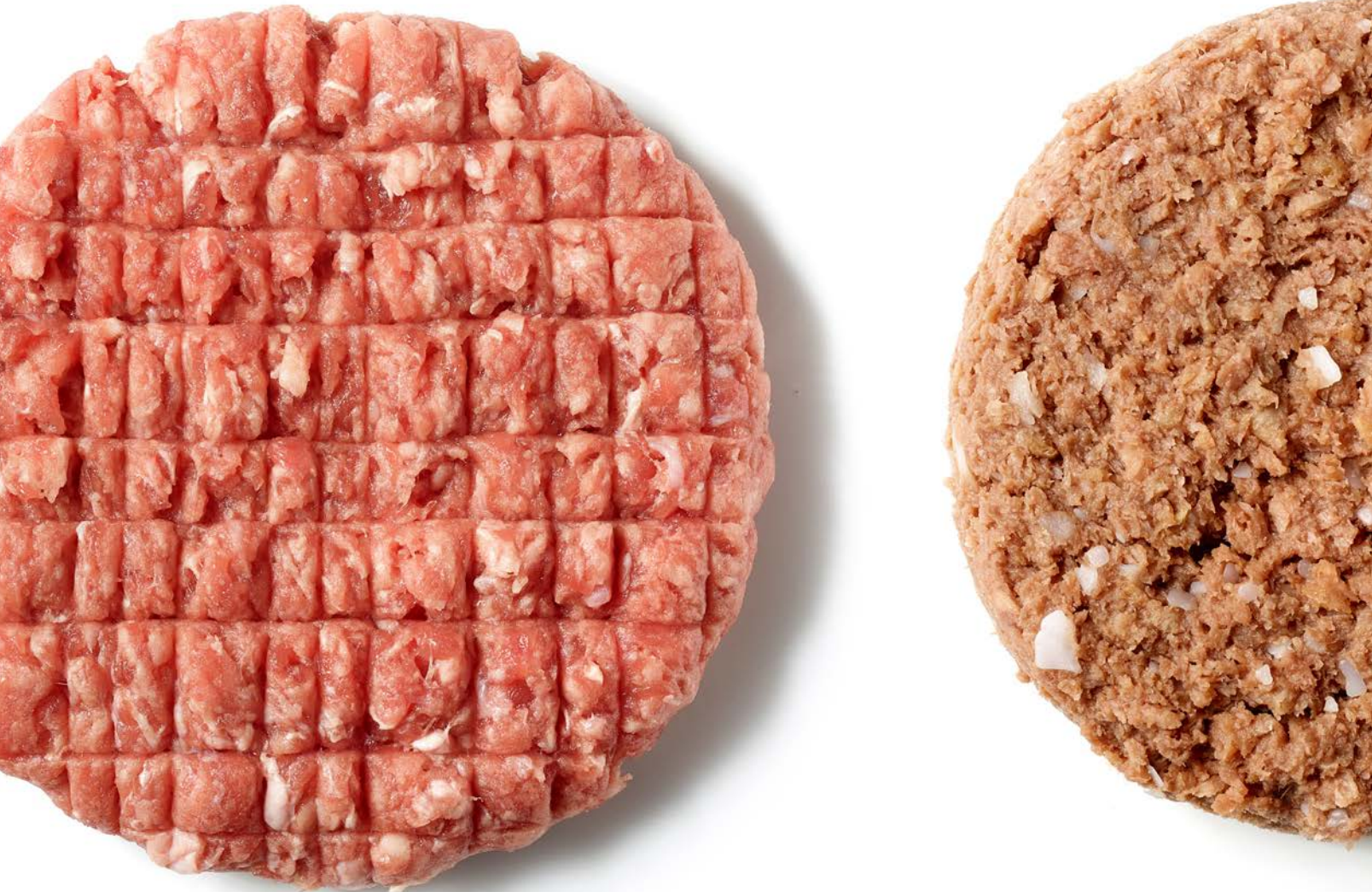
One real meat and two meat-free patties