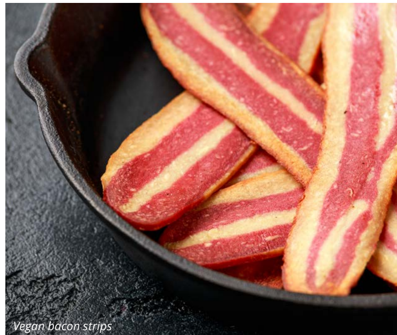
Vegan bacon strips

To that end, many of the companies developing new ultra-processed meat alternatives have attracted enormous investment. Some of the most visible names have gotten the most money, with Impossible Foods raising