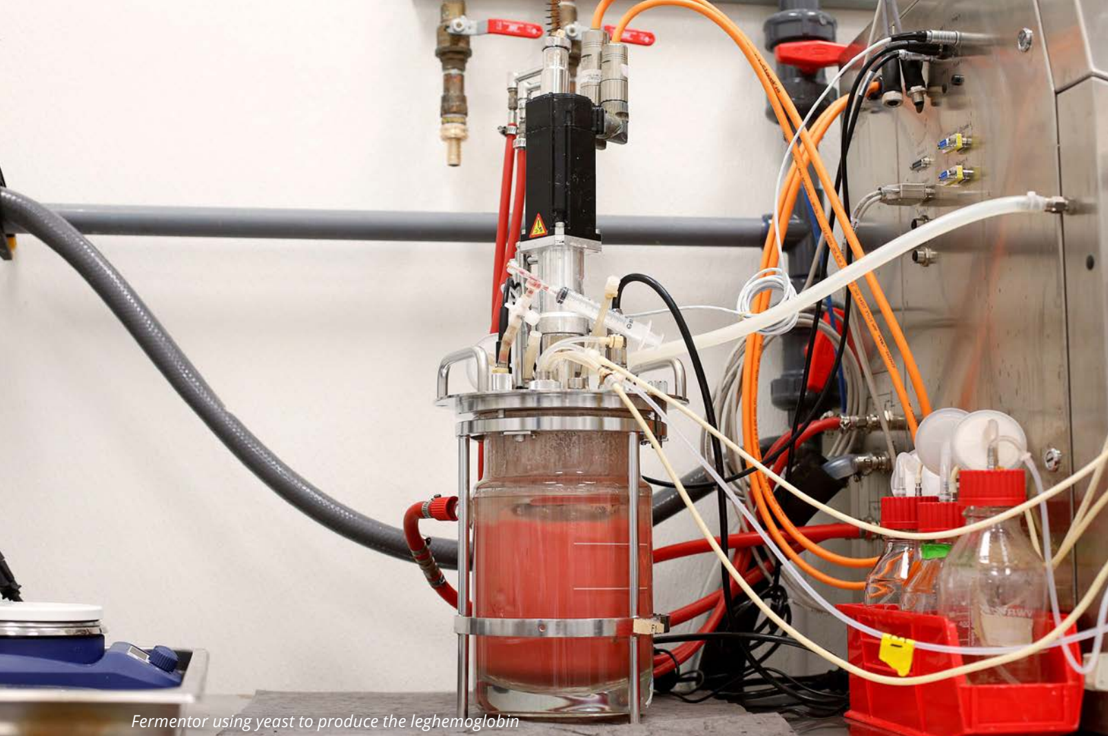
Fermentor using yeast to produce the leghemoglobin

We will not be covering lab-grown meats, which are part of the market development for alternative meat products, which are outside the scope of this paper and also not widely available to consumers.