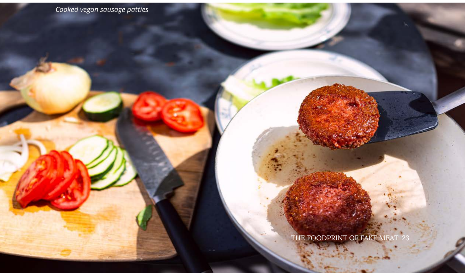
Cooked vegan sausage patties

Meat alternatives are not exempt from other food safety concerns. For conventional meat, most illness-causing bacteria that contaminate animal meat come from the animals themselves; so, it