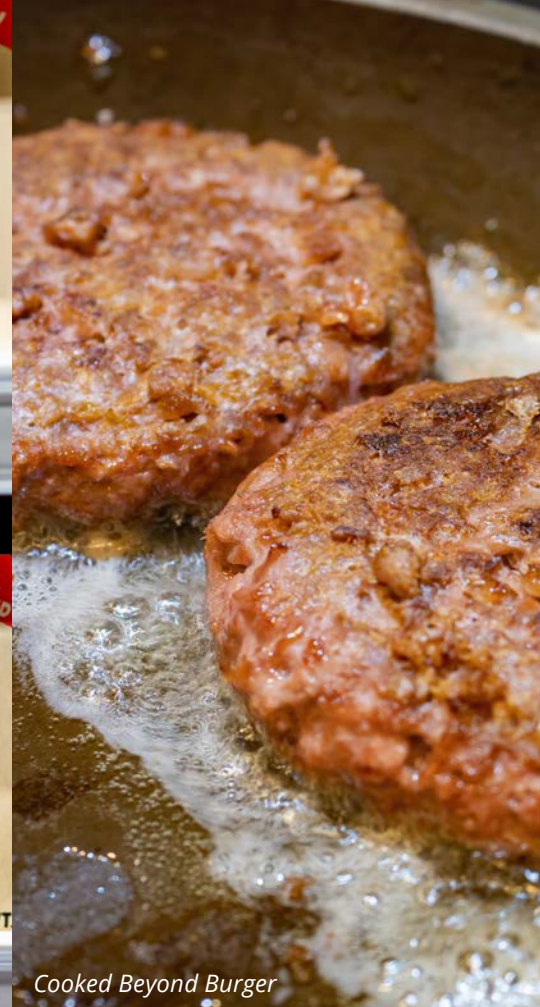
Cooked Beyond Burger

In contrast, the people most likely to be friendly to a meat alternative ate little to no meat to begin with and had strong attitudes toward the environment. 103 This runs counter to the Good Food Institute’s own research on consumer strategy, which states that “vegetarians and vegans should not be the target segment.” 104 Many fast food chains have replaced longstanding, customer-favorite vegetarian options with Beyond and Impossible products. 105 Rather than bringing meat-eaters towards plant-based foods, the newest generation of ultra-processed meat alternatives is mostly recontouring the existing suite of vegetarian options, displacing lower-impact options like traditional veggie burgers that vegetarians and vegans might find more appealing.