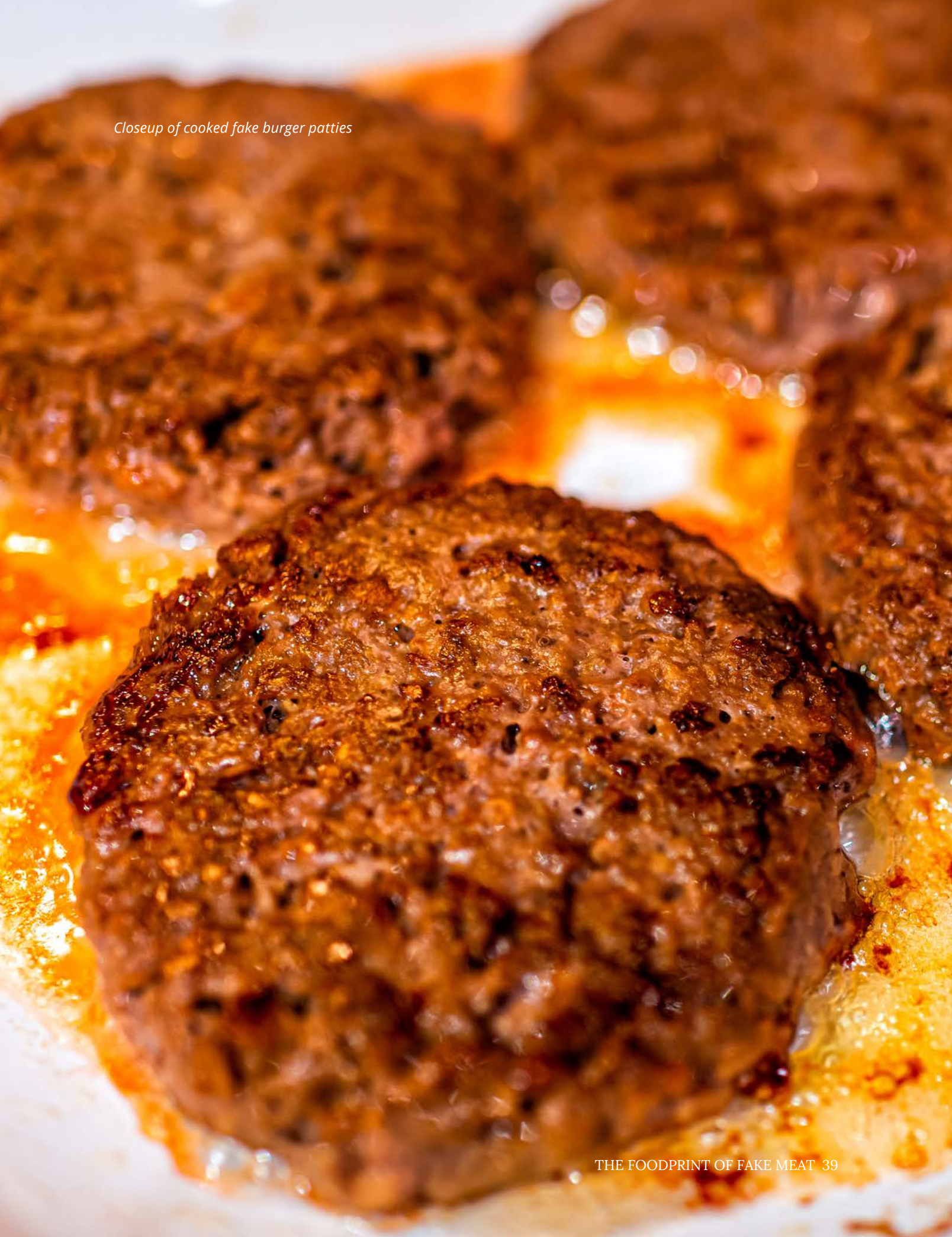
Closeup of cooked fake burger patties